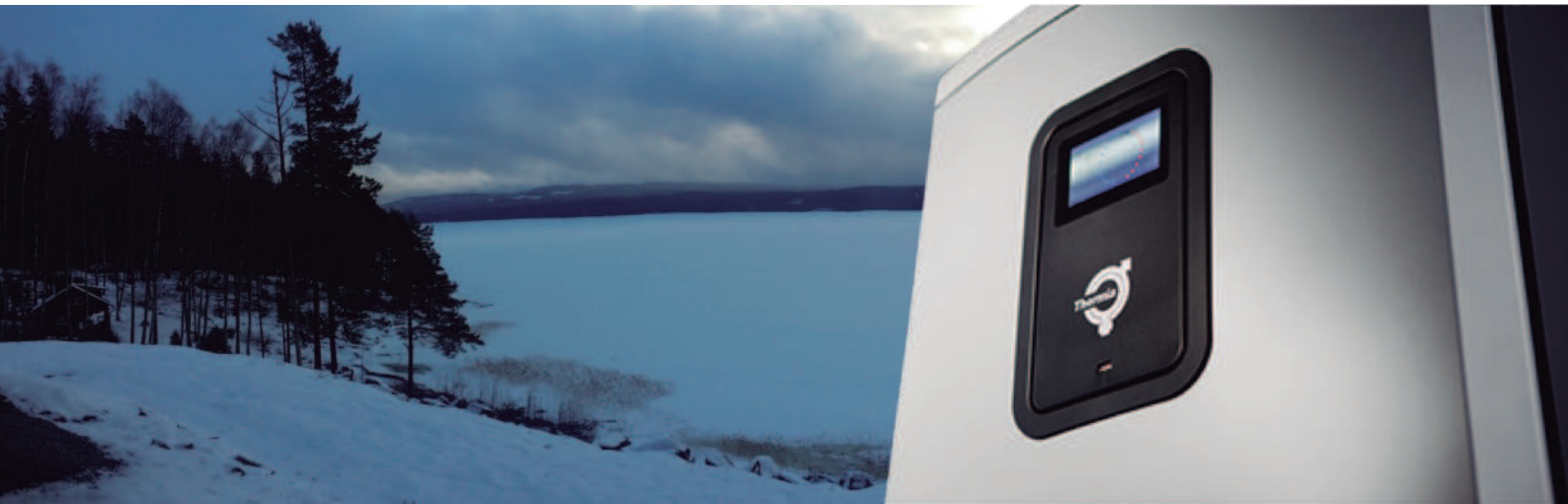
Diplomat Optimum Inverter